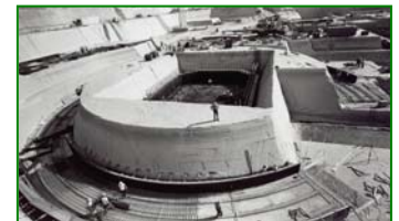
San Onofre Unit 2 under construction in the 1980s

The U.S. Nuclear Regulatory Commission (NRC) was created as an independent agency by Congress in 1974 to enable the nation to safely